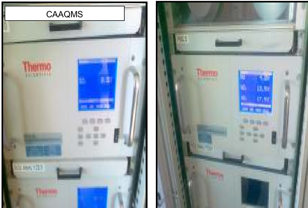
Photograph of CAAQMS

d) Online Monitoring system: Online Continuous Ambient Air Quality Monitoring Instruments are installed and commissioned for monitoring of PM, SO 2 , NO x & CO in the ambient air. The four locations have been approved for CAAQM stations. The Opacity meters have been installed & Commissioned at stack for monitoring of PM.