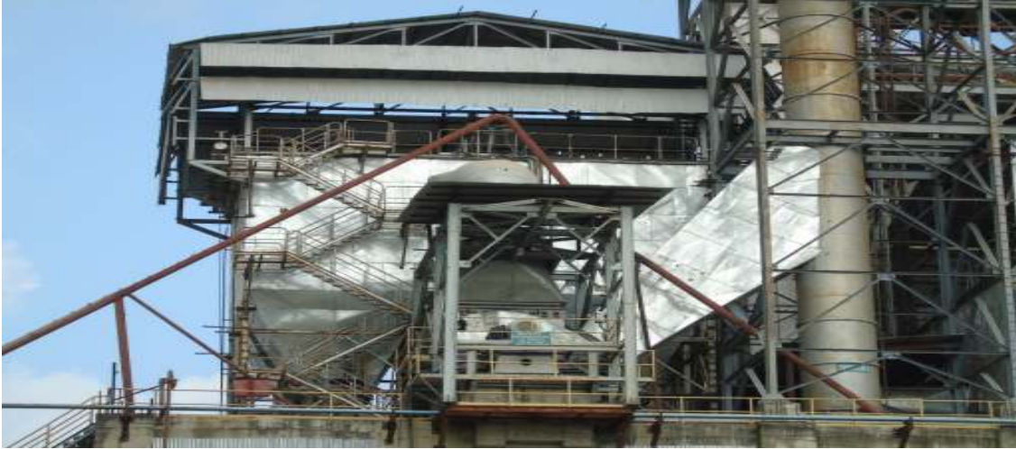
Photograph of bag house

High Efficiency Bag Houses (2Nos.) are attached to (Ball & Roll Press Mills) with guaranteed emission level of <30 \text{ mg/Nm}^3 at full load. Each Bag House has 1180 & 780 bags respectively. We have installed 34 no. of Bag Filters at various source points to control the fugitive emission. Details of Air Pollution Control Devices are given in Annexure - II