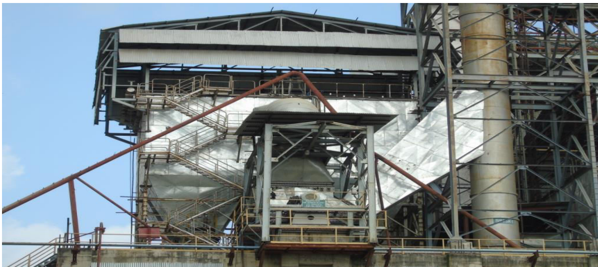
Photograph of Bag House

High Efficiency Bag Houses (2Nos.) are attached to (Ball & Roll Press Mills) with guaranteed emission level of <30 \text{ mg/Nm}^3 at full load. Each Bag House has 1180 & 780 bags respectively. We have installed 34 no. of Bag Filters at various source points to control the fugitive emission. Details of Air Pollution Control Devices are given in Annexure - II